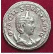
Otacilia Severa, wife of Emperor Philip I